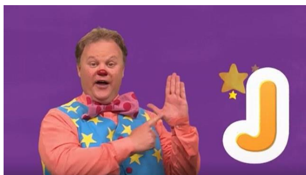
1 - j - open palm and write a j from middle finger to thumb

Here are this week's alphabet letters in Makaton, remember when saying someone's name, you use the Makaton sign for the first letter of their name.