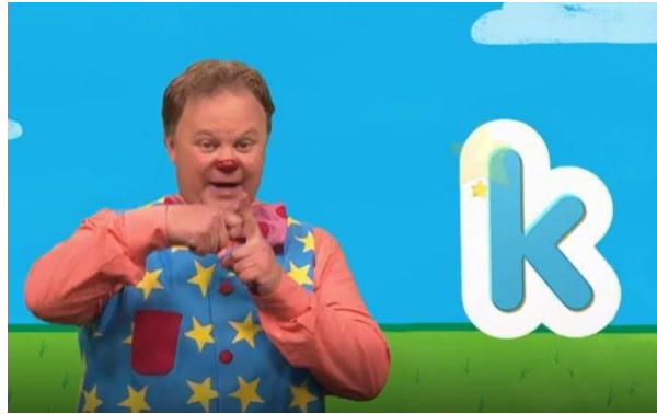
2 - k - forefinger and bend opposite forefinger to form a k