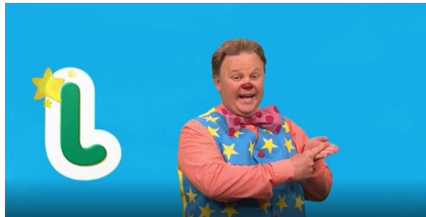
3 - l - single forefinger on open palm

Mr Tumble's Alphabet Song https://www.bbc.co.uk/cbeebies/watch/something-special-makaton-alphabet-song