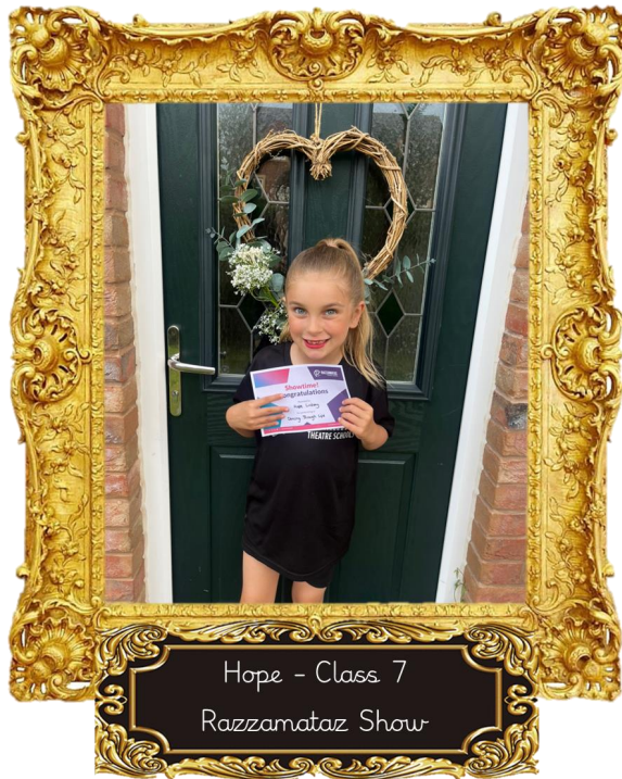
Hope - Class 7 Razzamataz Show