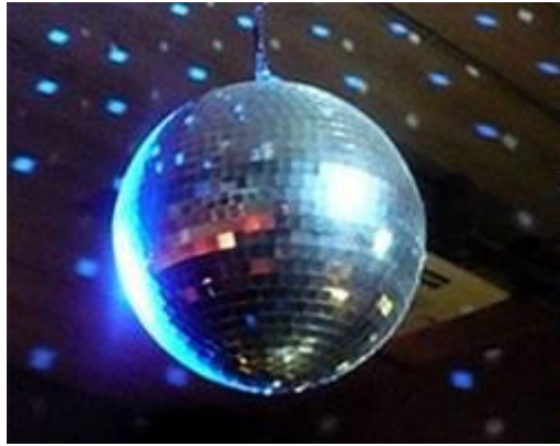
1 - Disco

Fundraising Disco - Thursday 19th December!