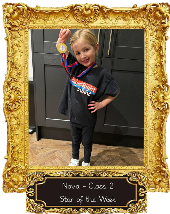
Nova - Class 2 Star of the Week